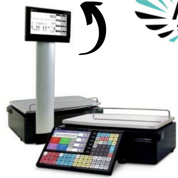
Ishida UNI 5