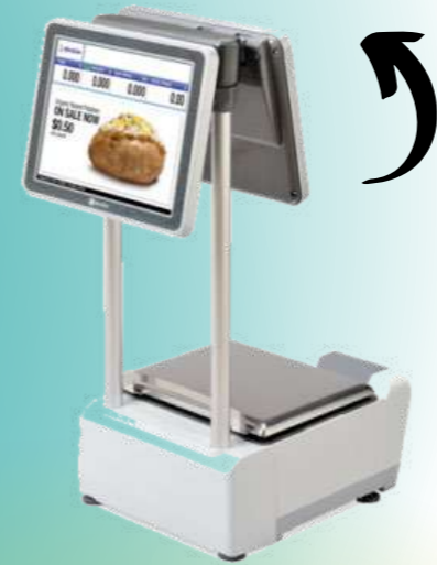
Ishida UNI 9