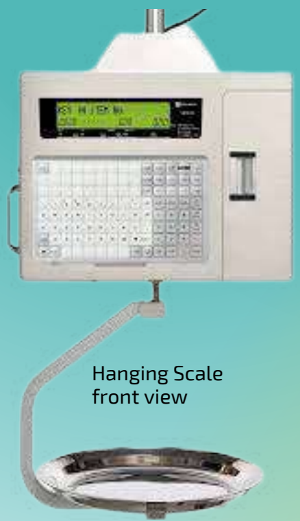
Hanging Scale front view

CONTACT US TODAY to discuss any weighing, labeling & barcoding applications or to arrange a FREE demonstration: